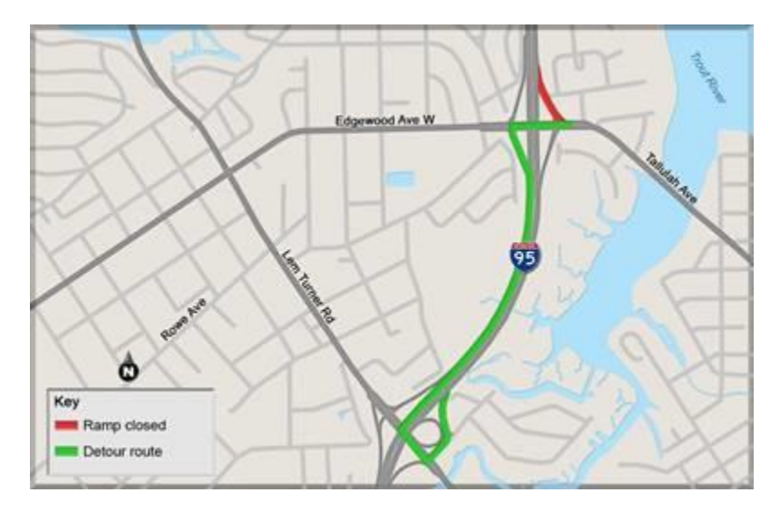
Detour D: May 9 from 7:30 p.m. to 6:30 a.m. motorists on northbound I-95 who wish to exit at Edgewood Avenue will take exit 356B, Lem Turner Road west, and continue on Lem Turner Road to Edgewood Avenue. (See map below)

Detour C: May 9 from 7:30 p.m. to 6:30 a.m. Motorists who wish to access I-95 north from Edgewood Avenue will take I-95 south to the Lem Turner Road exit, take a left on Lem Turner Road, take a left on Carrollton Road, then take a left at the I-95 north on-ramp. (See map below)